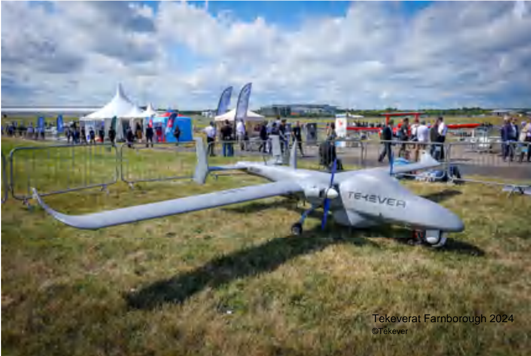
Tekeverat Farnborough 2024

Jammer guns are still promoted as a major remedy from stopping drones (along with conventional weapons) but they are increasingly seen as ‘no good’ against First Person View (fpv) drones and microcopters blessed with new transmission protocols. Their success market was early model drones and simple ‘toy’ drones.