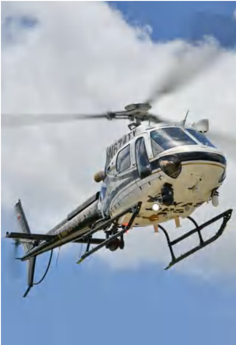
More arrivals for APSCON Houston on July 27 . [Norpress]