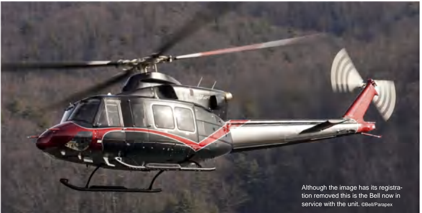
Although the image has its registration removed this is the Bell now in service with the unit. ©Bell/Parapex

NEW MEXICO: The Bernalillo County Sheriff’s Department Metropolitan Air Support Unit in Albuquerque has acquired a Bell 412EPI. This aircraft started off life in 2010 as a 412EP model, before becoming the development aircraft with Bell for the 412EPI standard. Clearly it no longer has a use with the manufacturer in Texas, and has now been sold to Bernalillo County Sheriff, replacing the UH-1H N911SZ that crashed in July 2022 with four fatalities. Additionally, they operate an Airbus AS350B3 N911ZZ. [Parapex/PAR]