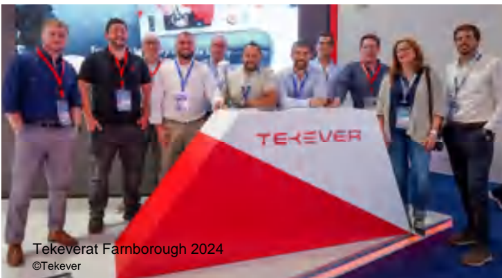
Tekeverat Farnborough 2024