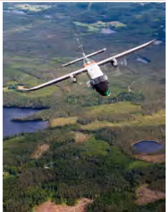
Right and above: The Dornier 228 has served the Border Guard in Finland for almost thirty years but a new jet replacement has been selected. The role fit interior of the Dornier dates from 1998.