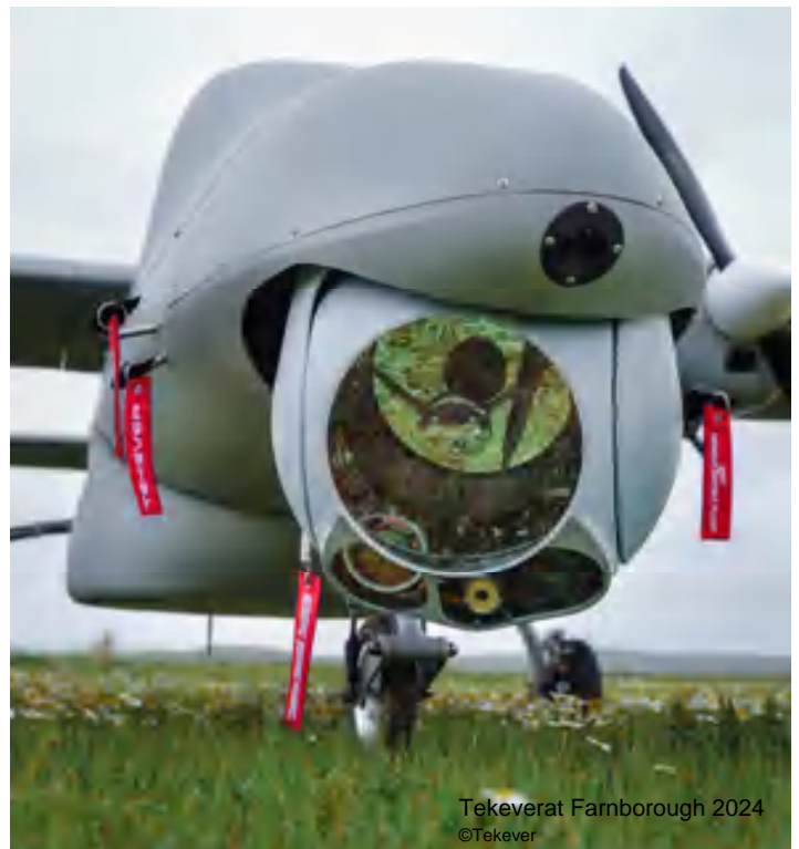
Tekeverat Farnborough 2024

This year, 12 years after their debut, they surprised everyone once more by presenting their first system made entirely in the UK.