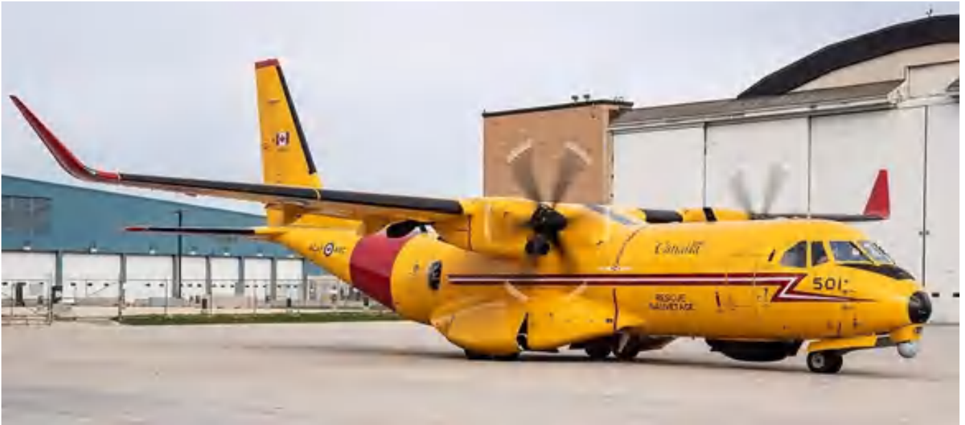
Above: The Airbus CC295 Kingfisher is the new patrol aircraft for the Canadian armed forces and replaces the DHC Buffalo aircraft previously operated on Search and Rescue missions.