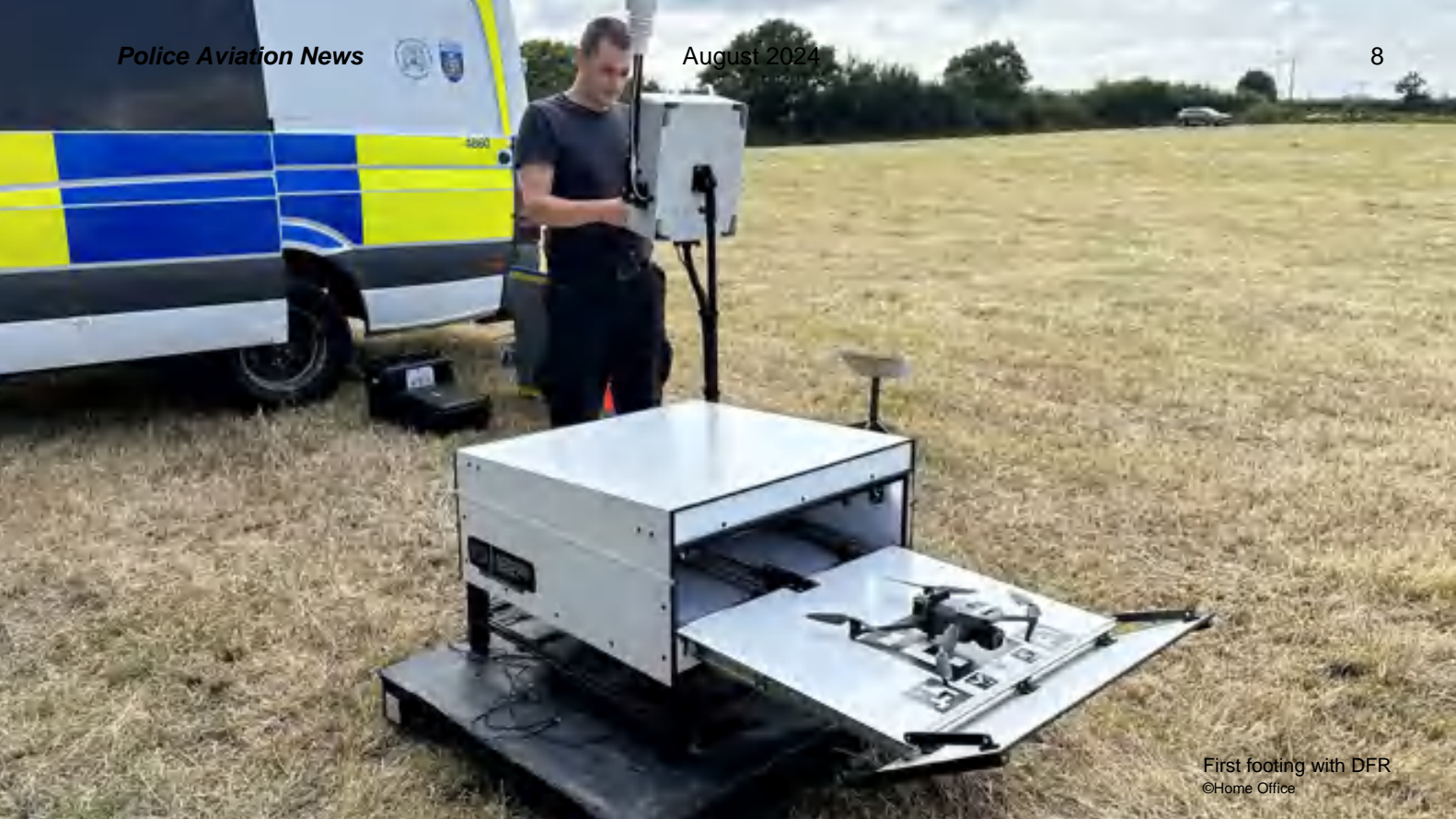
First footing with DFR

FIRST RESPONDER: The first UK operational flight of a 'Drone as First Responder' (DFR) took place over a festival on the Isle of Wight in late June.